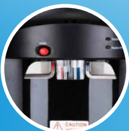
Concealed Water Outlet